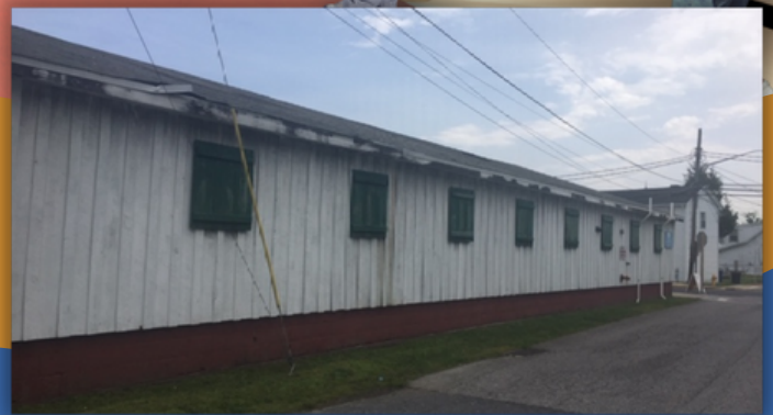
The St. Michaels Community Center prior to renovations.