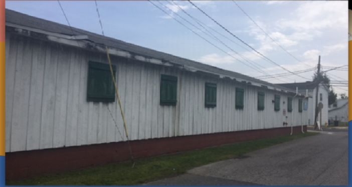
The St. Michaels Community Center prior to renovations.